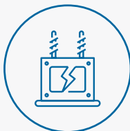
Transmission and Distribution of Electricity